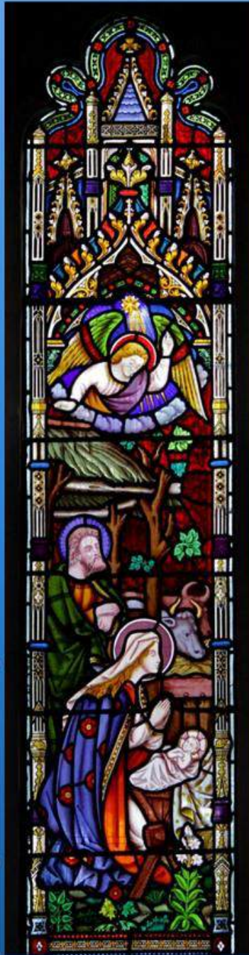
Stained glass window: St Mary's Church Guildford

- IMAGINING THEIR ROLES, FACING THE HARSH REALITIES