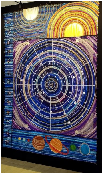
Threads through Creation, Guildford Cathedral October 2022

Thursday 6 th Thinking of Candlemass and light – Reflect on Genesis 1:1 – 2: In the beginning when God created the heavens the earth , the earth was a formless void and darkness covered the face of the deep, while a wind from God swept over the face of the waters. Then God said let there be light and there was light. And God saw that the light was good. Give thanks to God for Creation and the significant role of light in our lives, both practically and spiritually.